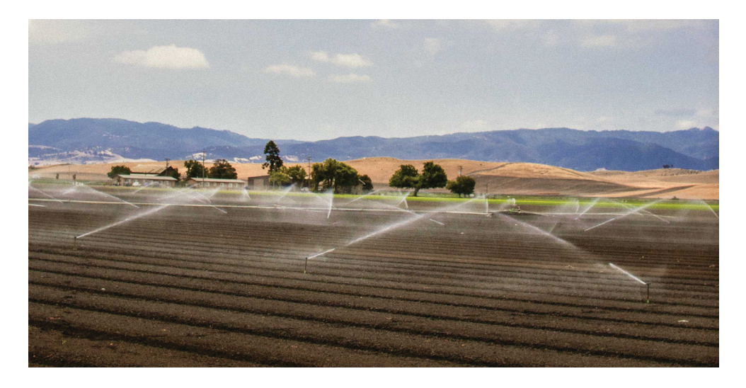
"What is the Sustainable Groundwater Management Act" continued from front...